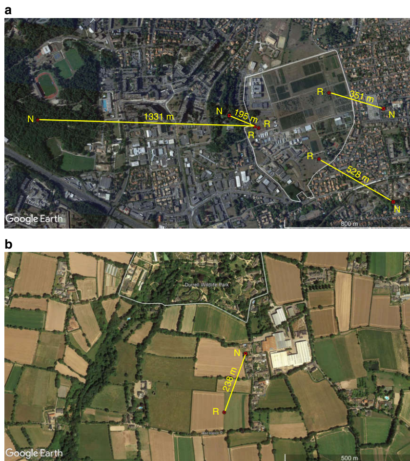
Fig. 3 Tracked hornets' nest locations. Captured hornet workers were fitted with a PicoPip Ag337 radio tag, released (R) in the vicinity of where they had been caught, and tracked via radio-telemetry on their return flights to their nests (N). Yellow lines and distances indicated relate to the shortest distance between a release point of a tracked hornet and her corresponding nest, rather than flight paths taken. a From the grounds of INRA Bordeaux-Aquitaine (white polygon) in Villeneuve d'Ornon, a suburb of Bordeaux. b Near Trinity and Durrell Wildlife Park (Les Augrès Manor; white polygon) on Jersey. GPS coordinates of the hornet release and nest locations were transferred onto satellite maps from GoogleEarthPro. Data on radio-tracked locations and waypoints are given in Supplementary Tables 2 and 3