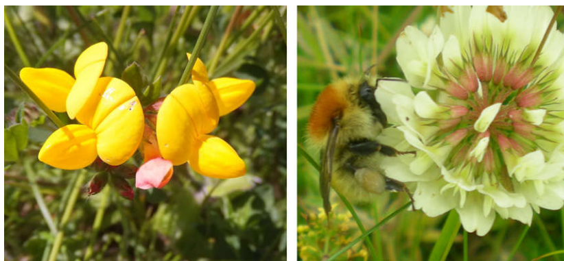
Fig. 1. Complex morphology of Lotus corniculatus (bird's foot trefoil; left) and Trifolium repens (white clover; right; being visited by the large carder bee, Bombus muscorum ).

(78 × 52 × 100 cm) in a bright but shaded outdoor location. Flight arenas were provisioned with two flowering L. corniculatus plants (with an average of 131 florets across both plants per day) and one flowering T. repens (average 11 flowering inflorescences per day; the term flower will subsequently be used to signify L. corniculatus florets and T. repens inflorescences). These species were chosen as they are known to be important forage plants for bumblebees (Carvell et al. 2006), and their flowers have complex morphology (Fig. 1) making them relatively difficult for bumblebees to learn how to handle to extract nectar and pollen. The number of flowers provided by each species was standardized across pairs so each colony in the pair (block) was exposed to the same floral density on each day.