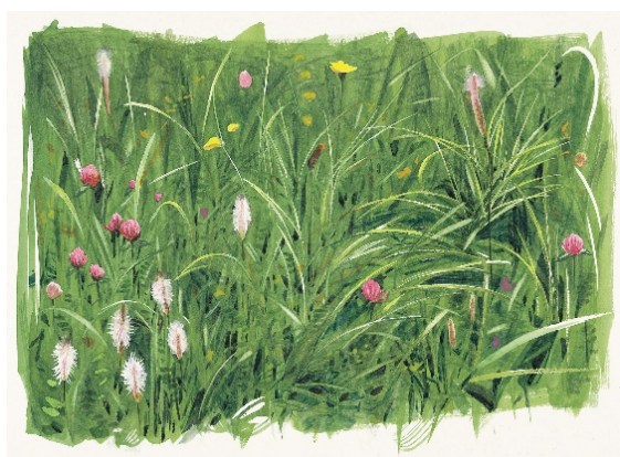
Figure 5. Pollinator habitats in naturalist paintings by A. Ambrogio. Courtesy of A. Ambrogio.