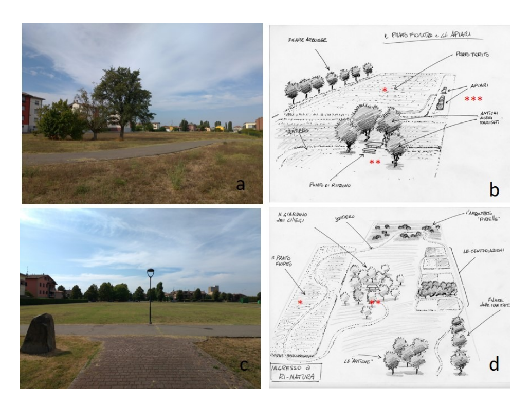
Figure 3. The Ri-natura project of the Sorbolo-Mezzani Municipality. Areas of intervention ( a , c ) and projects to transform them into multiservice green areas ( b , d ) with wildflower meadows (*), recreation/educational areas (**), and a small apiary (***).