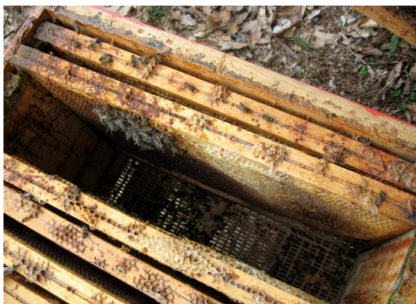
Suspected case of Colony Collapse Disorder: bees have abandoned the hive.

This working group included representatives of BASF, Bayer Crop Science, and Eurofins GAB; as well as representatives from the British and French food safety agencies FERA 13 and ANSES 14 , and the Julius Kühn Institute from Germany.